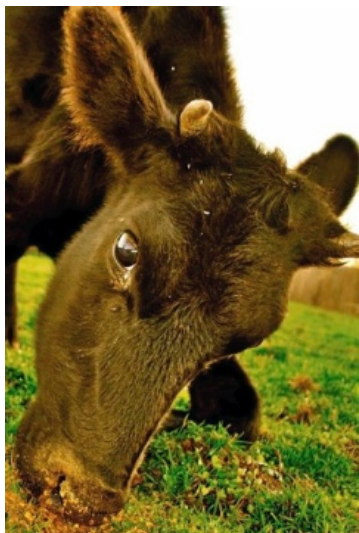
Mo, a disabled cow who avoided death in a slaughterhouse by arriving at the sanctuary, is one of the film's featured animals.